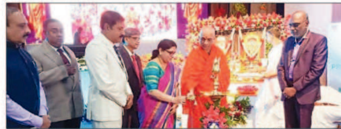
ಆದಿಚುಂಚನಗಿರಿ ಮೆಡಿಕಲ್ ಕಾಲೇಜಿನ ಆಡಿಟೋರಿಯಂನಲ್ಲಿ ನಡೆದ ಪ್ರೇರಣಾ ಕಾರ್ಯಕ್ರಮವನ್ನು ಶ್ರೀ ನಿರ್ಮಲಾನಂದನಾಥ ಸ್ವಾಮೀಜಿ ಉದ್ಘಾಟಿಸಿದರು.

ಆದಿಚುಂಚನಗಿರಿ ಮಠದ ಪೀಠಾಧ್ಯಕ್ಷ ಡಾ.ನಿರ್ಮಲಾನಂದನಾಥ ಸ್ವಾಮೀಜಿ ಸಾನ್ನಿಧ್ಯದಲ್ಲಿ ನಡೆದ ಕಾರ್ಯಕ್ರಮದಲ್ಲಿ ಕಾಲೇಜಿನಲ್ಲಿ ವಿದ್ಯಾರ್ಥಿಗಳ ಸಂಗಮವಾಗಿತ್ತು. ವಿದ್ಯಾರ್ಥಿಗಳ ಸಂಗಮವಾಗಿತ್ತು. ವಿದ್ಯಾರ್ಥಿಗಳ ಸಂಗಮವಾಗಿತ್ತು.