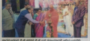
ನಾಗಮಂಗಲ: ತಾಲೂಕಿನ ಬಿಜಿ ನಗರದ ಆದಿಚುಂಚನಗಿರಿ ವಿಶ್ವವಿದ್ಯಾಲಯ ವ್ಯಾಪ್ತಿಯ ಆದಿಚುಂಚನಗಿರಿ ಆಸ್ಪತ್ರೆ ಮತ್ತು ಸಂಶೋಧನಾ ಕಾಲೇಜು ವತಿಯಿಂದ ಪ್ರೇರಣಾ ಕಾರ್ಯಕ್ರಮವನ್ನು ಆಯೋಜಿಸಿದ್ದು, ಆದಿಚುಂಚನಗಿರಿ ಮೆಡಿಕಲ್ ಕಾಲೇಜಿನಲ್ಲಿ ವಿದ್ಯಾರ್ಥಿಗಳ ಸಂಗಮವಾಗಿತ್ತು.

ನಾಗಮಂಗಲ: ಗ್ರಾಮೀಣ ಜನರ ಆರೋಗ್ಯ ಮತ್ತು ಕುಟುಂಬದ ಕಲ್ಯಾಣಕ್ಕೆ ಕೊಡುಗೆ ನೀಡಲು ಸಾಧ್ಯವಾಗುವಂತೆ ಆದಿಚುಂಚನಗಿರಿ ವಿಶ್ವವಿದ್ಯಾಲಯ ವ್ಯಾಪ್ತಿಯ ಆದಿಚುಂಚನಗಿರಿ ಆಸ್ಪತ್ರೆ ಮತ್ತು ಸಂಶೋಧನಾ ಕಾಲೇಜು ವತಿಯಿಂದ ಪ್ರೇರಣಾ ಕಾರ್ಯಕ್ರಮವನ್ನು ಆಯೋಜಿಸಿದ್ದು, ಆದಿಚುಂಚನಗಿರಿ ಮೆಡಿಕಲ್ ಕಾಲೇಜಿನಲ್ಲಿ ವಿದ್ಯಾರ್ಥಿಗಳ ಸಂಗಮವಾಗಿತ್ತು.