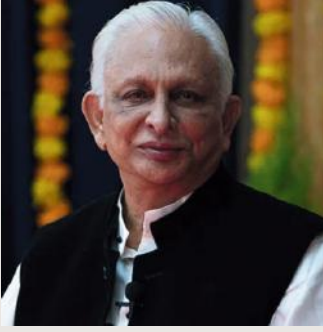
Sri M 2018