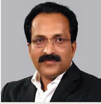
Shri S. Somanath 2024