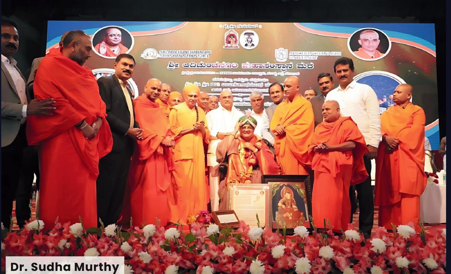
Dr. Sudha Murthy 2023