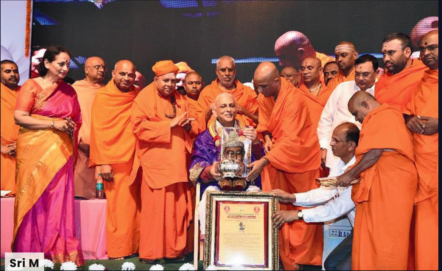
Sri M 2018