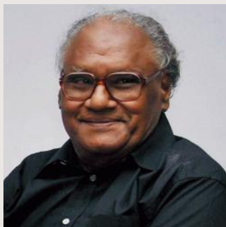
Dr. CNR Rao