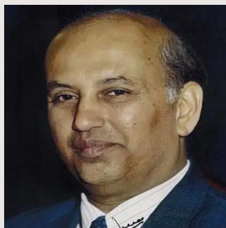
Dr. U R Rao

Dr. Chintamani Nagesa Ramachandra Rao, popularly known as Dr. CNR Rao, is a renowned chemist whose contributions to solid-state and materials chemistry are globally recognized. His work has significantly advanced the field of science, promoting innovation and excellence. Dr. Rao's dedication to scientific research and education aligns with SDG 4: Quality Education and SDG 9: Industry, Innovation, and Infrastructure, as his efforts have strengthened scientific infrastructure and educational standards.