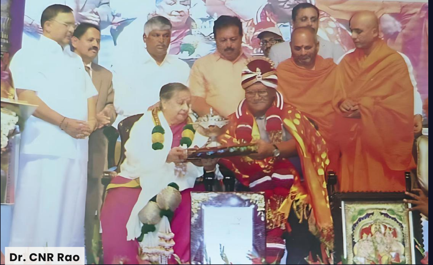
Dr. CNR Rao 2016