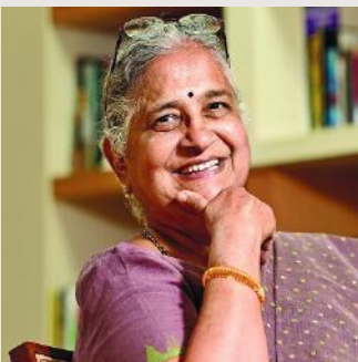
Dr. Sudha Murthy 2023