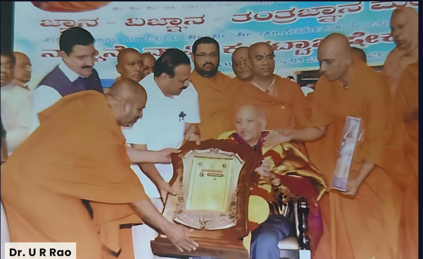
Dr. U R Rao 2017