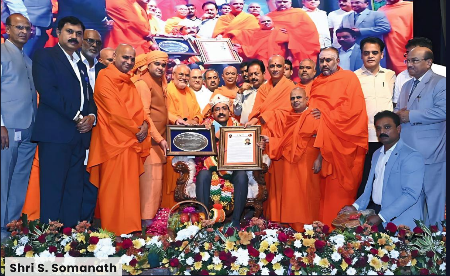
Shri S. Somanath 2024

The Vijnatham Award, with its focus on honoring excellence in science, technology, and wisdom, plays a crucial role in promoting sustainable development and inspiring future generations. Adichunchanagiri University's commitment to education, community engagement, and innovation ensures that students are well-equipped to contribute positively to society. Through the Vijnatham Award and other initiatives, the university continues to make a significant impact on both local and global communities, aligning with the United Nations' Sustainable Development Goals.